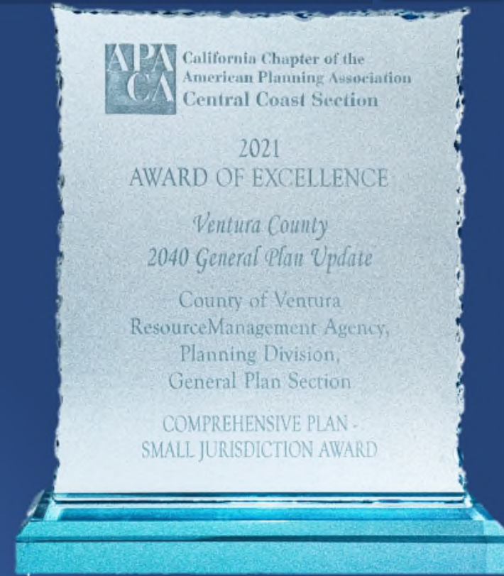
American Planning Association Award for the 2040 General Plan Update