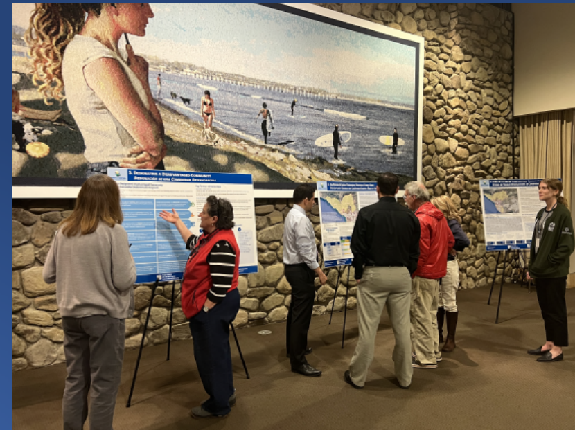
Recent DDC Public Outreach