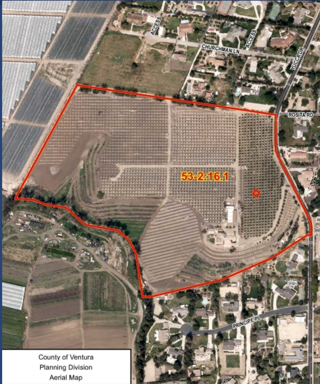
County of Ventura Planning Division Aerial Map

General Plan: Open Space Zoning Designation: AE-40 ac (Agricultural Exclusive, 40 acre minimum parcel size)