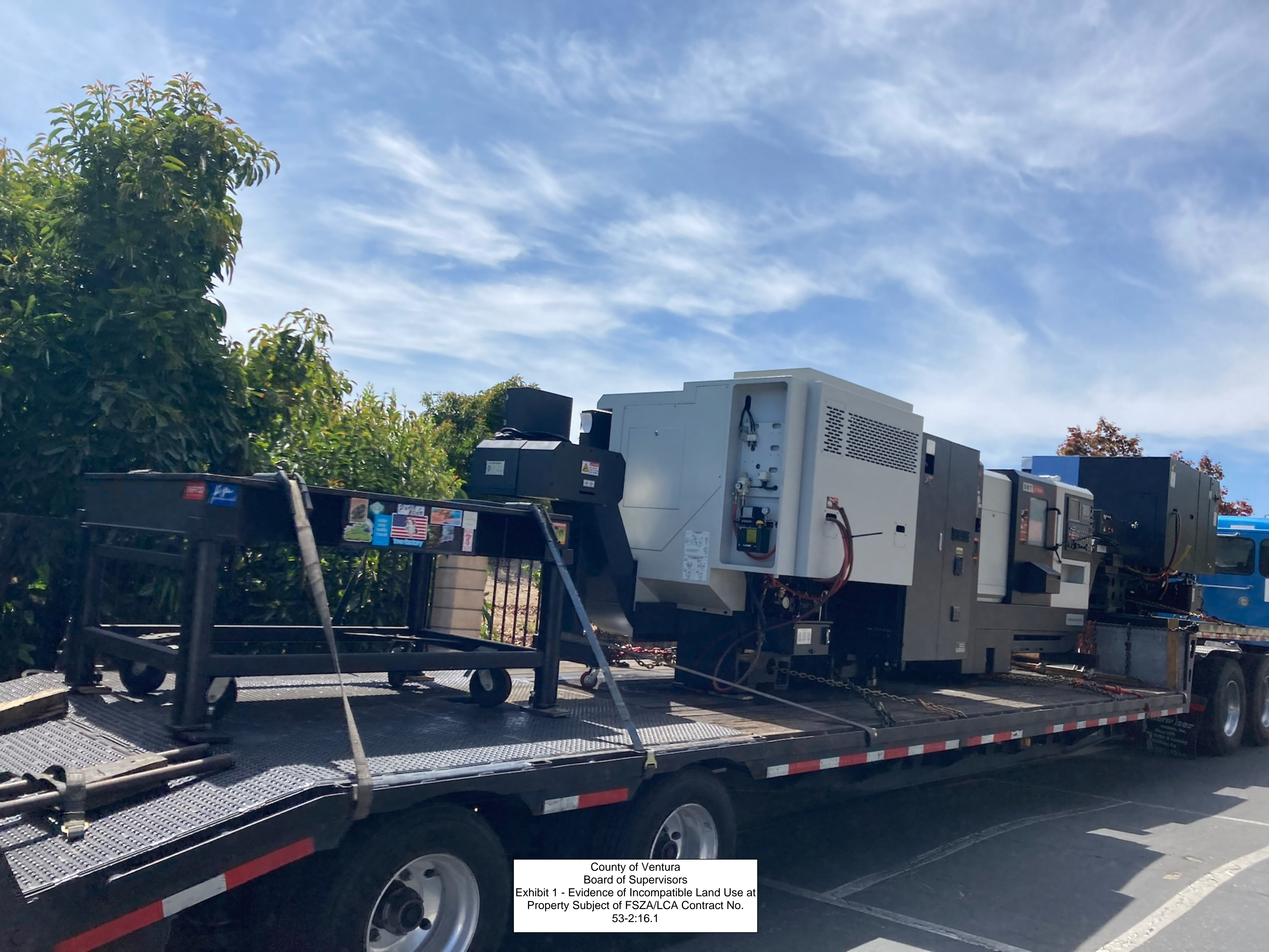
County of Ventura Board of Supervisors Exhibit 1 - Evidence of Incompatible Land Use at Property Subject of FSZA/LCA Contract No. 53-2:16.1