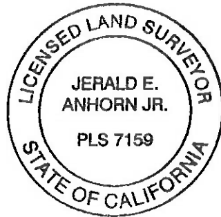
EXHIBIT "B" ATTACHED HERETO AND BY THIS REFERENCE MADE A PART HEREOF.

THIS DESCRIPTION WAS PREPARED BY ME OR UNDER MY DIRECTION: