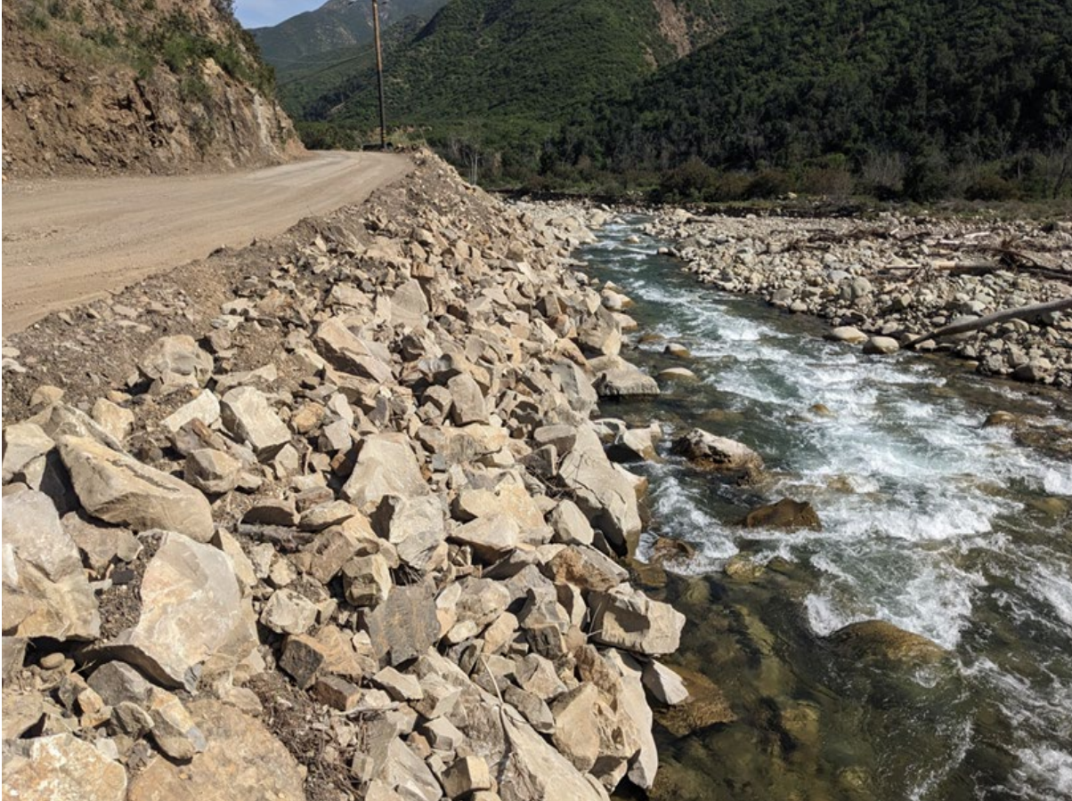
Before Damage, Summer 2023