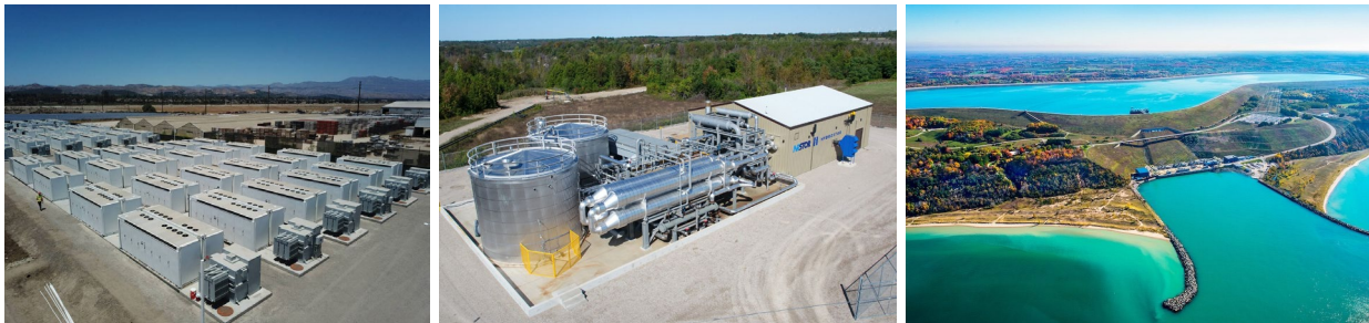
Figure 3: Types of Energy Storage - Lithium Ion Battery (left), Compressed Air (center), and pumped hydropower (right)

A number of additional technical terms are used throughout this Board Letter; please refer to Exhibit 2 for a list of definitions from the California Independent System Operator.