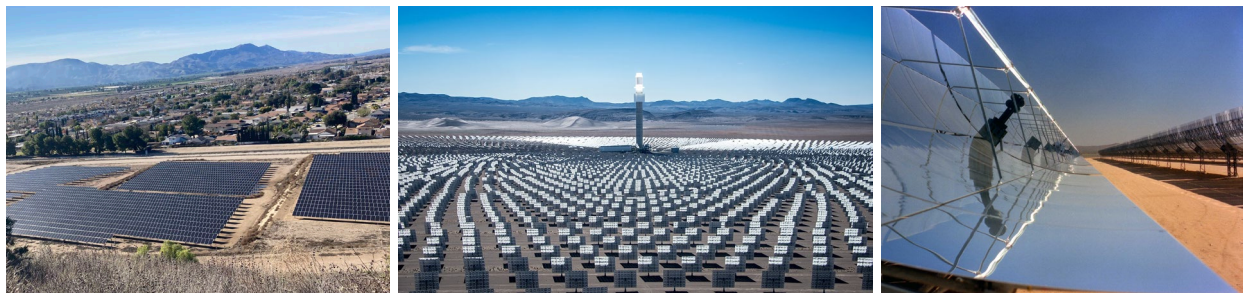
Figure 1: Types of Solar Arrays - PV (Left), Solar Tower Concentrator (Center), and Solar Line Concentrator (Right)

Wind Turbines: There are two main types of wind power generation: horizontal axis and vertical axis (Figure 2). Only the horizontal axis type was reviewed as it is the most common and produces the most electricity of the two types. This type uses a turbine that has airplane propeller-like blades. Wind turns the blades, which spin the turbine, generating an electrical charge, which is then turned into electricity. However, wind energy requires certain average sustained wind speeds to ensure operational viability.