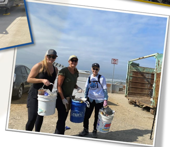
Photos: Camp Host Program(left); Hobson Beach (right); Coastal Clean-Up