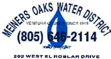
EXHIBIT B – DISCLOSURE CATEGORIES

The terms italicized below have specific meanings under the Political Reform Act. In addition, the financial interests of a spouse, domestic partner, and dependent children of the public official holding the designated position may require reporting. Consult the instructions and reference pamphlet of Form 700 for an explanation.