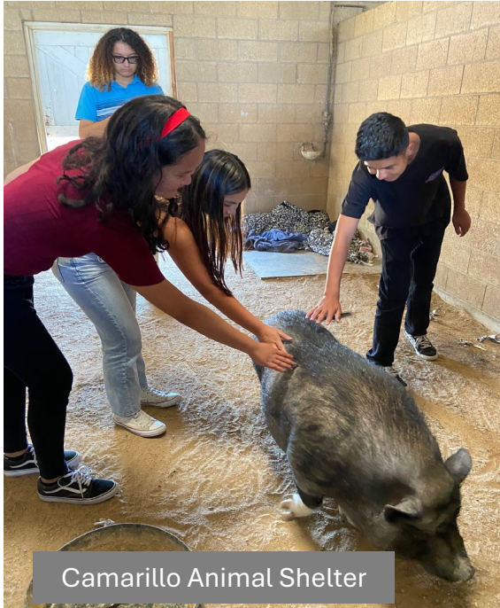
Camarillo Animal Shelter