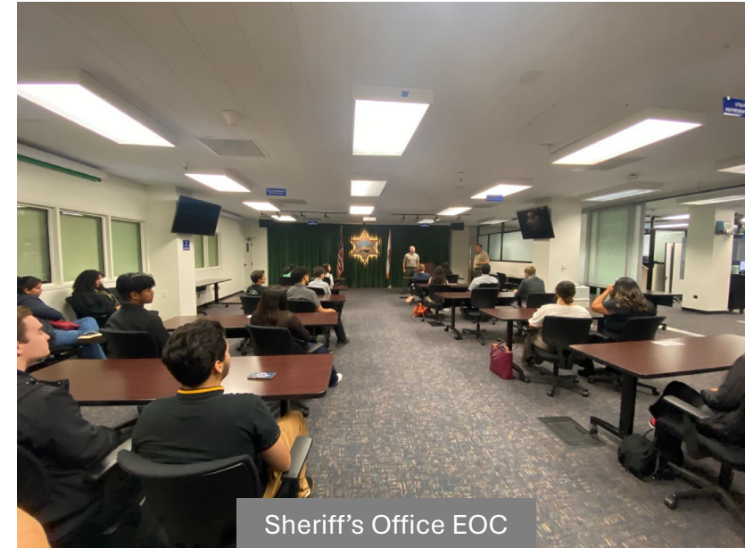
Sheriff's Office EOC