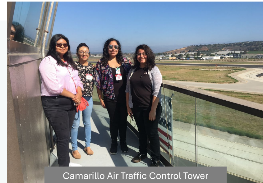
Camarillo Air Traffic Control Tower