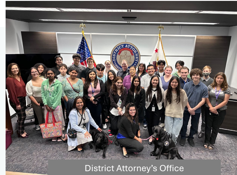
District Attorney's Office