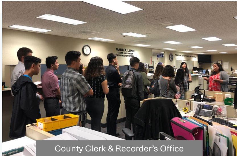
County Clerk & Recorder's Office