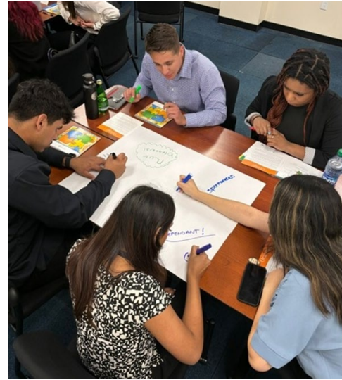
Real Colors Sessions