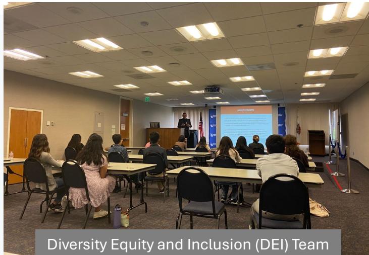
Diversity Equity and Inclusion (DEI) Team