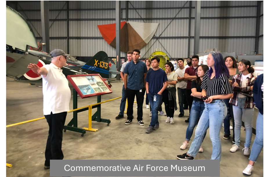
Commemorative Air Force Museum