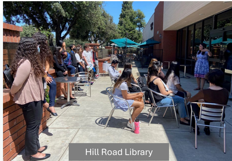
Hill Road Library