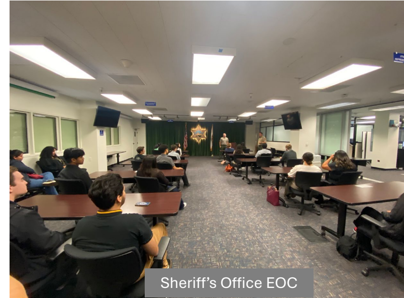
Sheriff's Office EOC