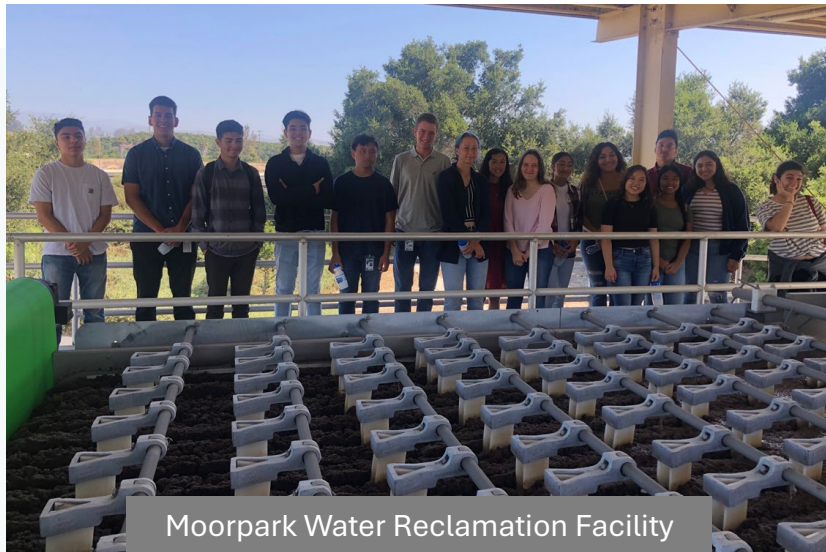
Moorpark Water Reclamation Facility