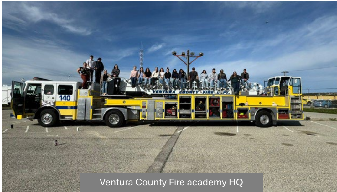
Ventura County Fire academy HQ