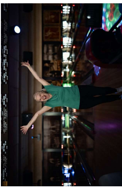
Employee Bowling Tournament