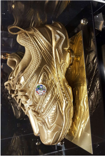
Golden Sneaker Inter-Agency Competition