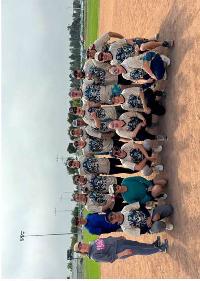
Employee Softball Tournament