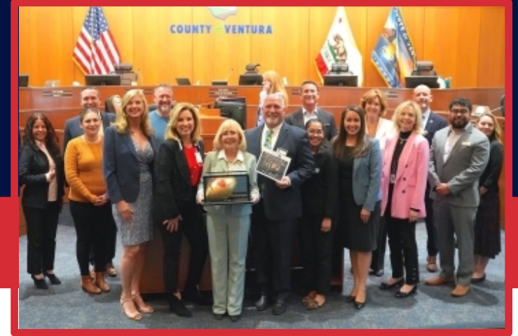
Board of Supervisors Small Division

Congratulations to the Winning Teams of the 2024 WeGive Golden Football Challenge!