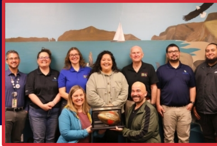
Ventura County Library Medium Division