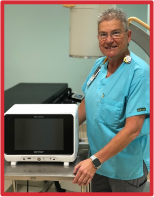
Radio Frequency Ablation