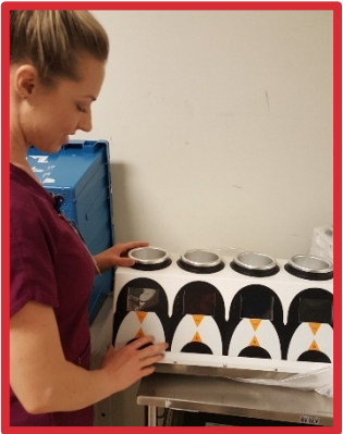
Breast Milk Warmers