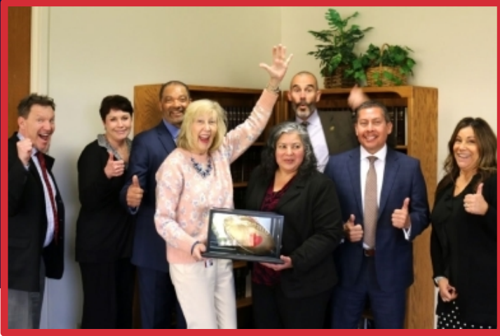
Ventura Superior Courts Large Division