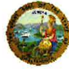
GAVIN NEWSOM GOVERNOR