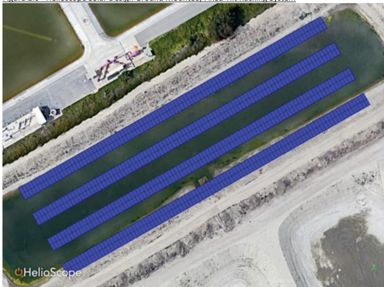
Figure 1.0 - Helioscope Solar Design Ground Mounted, Fixed Tilt Racking System

Client shall pay Service Provider One Million Four Hundred Sixty-Nine Thousand Nine Hundred Seventeen dollars and Zero cents ($1,469,917.00) for the Project.