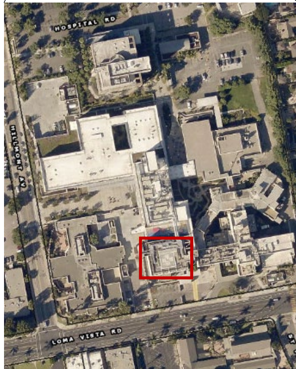
VICINITY AND LOCATION MAP EXHIBIT 1