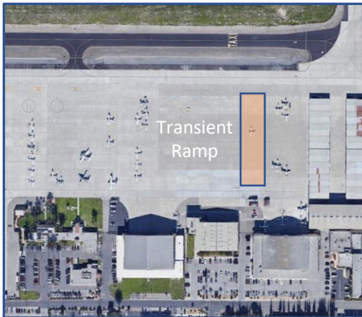
Camarillo Transient Ramp