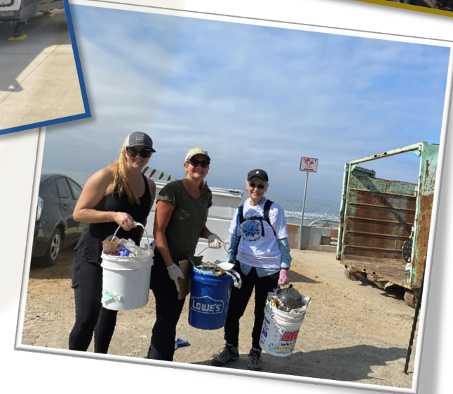
Photos: Camp Host Program(left); Hobson Beach (right); Coastal Clean-Up